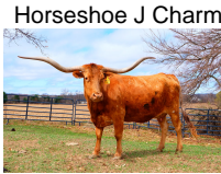
Horseshoe J Charm