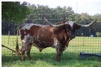
J S OVERDRIVE