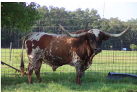
J S OVERDRIVE