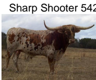
Sharp Shooter 542