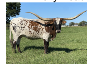
HL FOXY BEAUTY