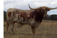
Sharp Shooter 542