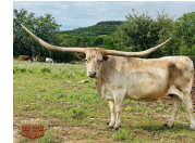
PCC DAZZLE DOLL