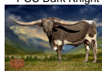
PCC Dark Knight