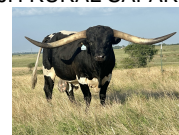
JH RURAL SAFARI SON