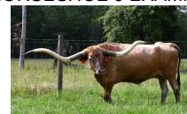
HORSESHOE J EXAMPLE