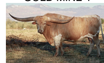
GOLD MINE 1