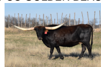
PCC GOLDEN BEAUTY